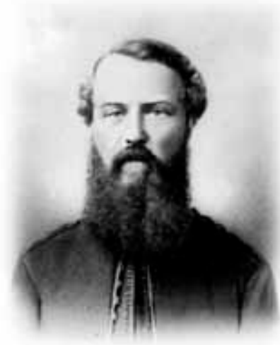
Colonel Richard Moody of the Royal Engineers

The Governor proposed the loyal toasts of the old country, which were drunk with all honours. The bishop and clergy of the diocese were named with much kindness and their healths drunk with three times three and one cheer more.