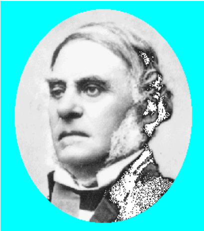
Governor James Douglas: Father of BC