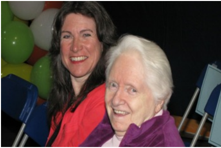
Present and Past PoCo Heritage Presidents enjoy May Day Opening Ceremonies