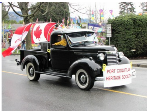
Todd shows the flag for PoCo Heritage in his vintage truck