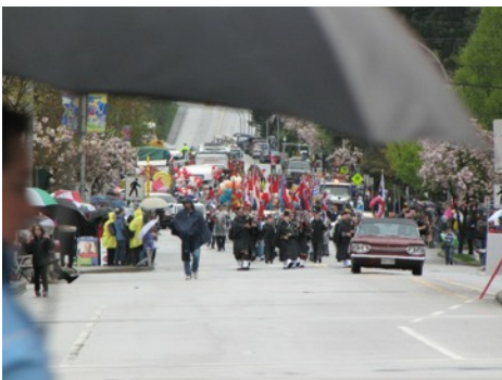
An unusually soggy May Day Parade